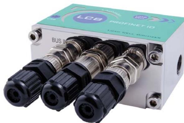
LCB WITH FLYING CONNECTORS